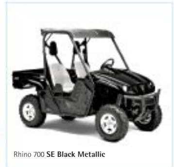
Rhino 700 SE Black Metallic