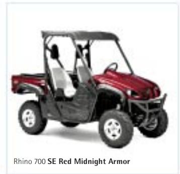
Rhino 700 SE Red Midnight Armor