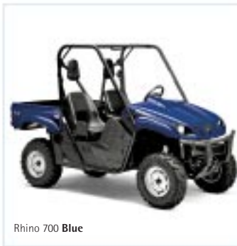
Rhino 700 Blue

When you're working or wanting to answer the call of the wild, you need equipment you can trust. And when you're getting years of fun and hard work from your Rhino you'll know you can also rely on Yamaha's superb dealer and service network. You will find everything you need at your Rhino dealer, including a great range of genuine accessories, from winch kits, overfenders and cargo boxes to seat covers, lighting and body kits. Or visit www.yamaha-motor-acc.com