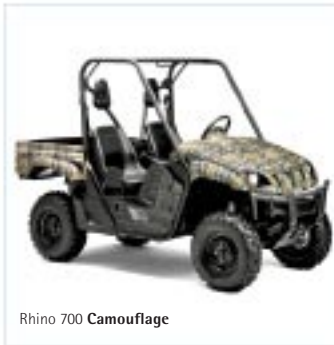
Rhino 700 Camouflage