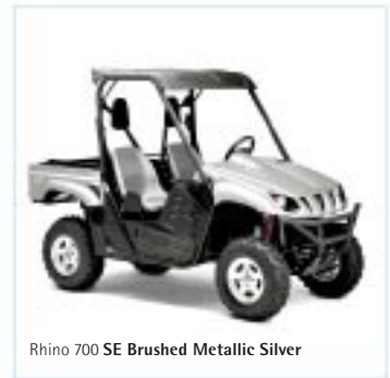
Rhino 700 SE Brushed Metallic Silver