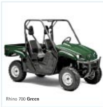
Rhino 700 Green