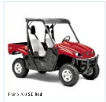
Rhino 700 SE Red